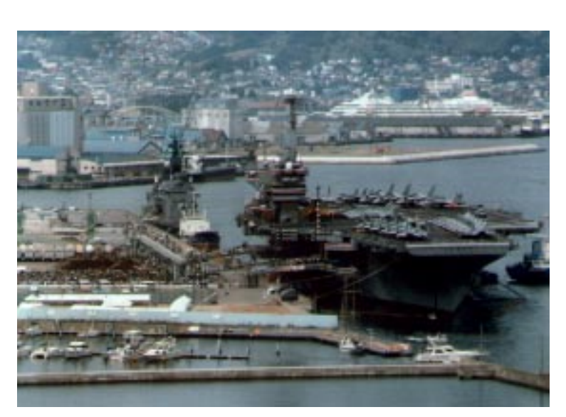
Approximately 140,000 Japanese citizens visited the USS Independence (CV–62) during its first visit to a Japanese port, Otaru, Japan, September 6–7, 1997.

The U.S. has also made progress to return base and training-related land, to alter operational procedures in host countries in an effort to respond to local concerns, and to be better neighbors