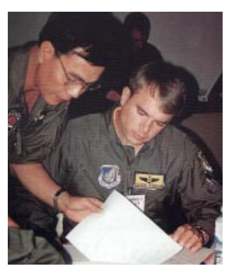
A U.S. Air Force pilot reviews exercise flight plans with a Singapore Air Force pilot during a combined exercise.