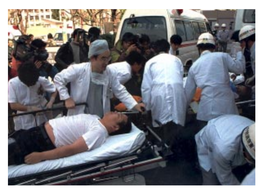
Subway passengers are taken on stretchers from ambulances after falling victim to the Aum Shinrikyo gas attack on a Tokyo subway, March 20, 1995.

potential connection between the proliferation of weapons of mass destruction and terrorism.