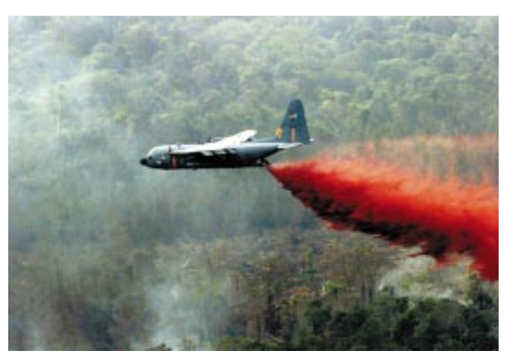
A U.S. C–130 transport plane releases fire-retardant chemicals to help put out wildfires in Sumatra, Indonesia, November 1997.

In many areas around the world, U.S. forces have combined humanitarian relief efforts with peacekeeping operations (PKO). The United States will remain an advocate of and active participant in PKO missions where important or compelling humanitarian interests are at stake. The most notable peacekeeping effort in