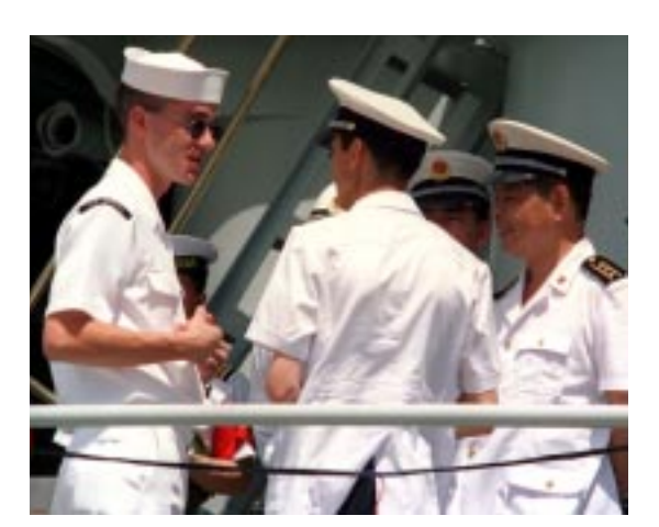
A U.S. Navy sailor talks to Chinese sailors in Hawaii on March 9, 1997, a goodwill visit designed to increase mutual understanding and confidence between the two largest fleets in the Asia-Pacific region.

and pledged to cooperate on military environmental protection and security. Consistent with these initiatives, the United States will seek further progress in Chinese military transparency, particularly in strategic doctrine, budgets and force structure.