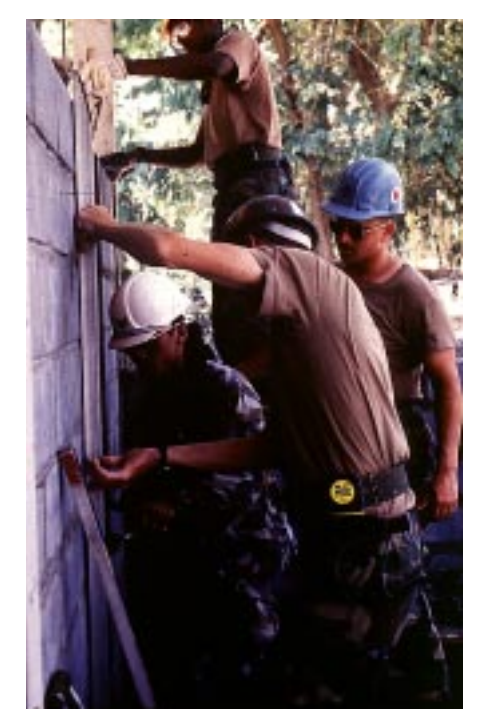
U.S. Army Pacific and Royal Thai Army engineers work side-by-side to construct a schoolroom during COBRA GOLD '97 in Thailand.

For instance, regional cooperation may also increasingly encompass use of common facilities, as well as reciprocal military provision of supplies, services and logistical support. In nations where the United States maintains bases or conducts regular training and exercises, the conclusion of Acquisition and Cross Servicing Agreements (ACSA) will not only provide for such assistance but also offer material and symbolic evidence of regional support for U.S. presence in general. The signing of a revised ACSA with Japan in April 1998 was a step in this direction, and the United States will seek other ACSA agreements elsewhere in the region in coming years.