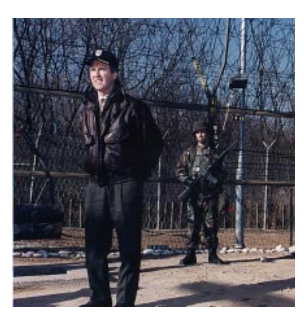
Secretary of Defense William Cohen stands at the fence line marking the southern boundary of the Demilitarized Zone (DMZ), separating the Republic of Korea from the communist North.

ban anti-personnel landmines. He noted that the Convention did not contain an adequate transition period for the United States to safely phase out and develop alternatives to its APLs, including