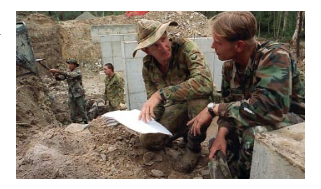
U.S. and Australian military engineers build a bridge together during exercise TANDEM THRUST 97 in Australia.