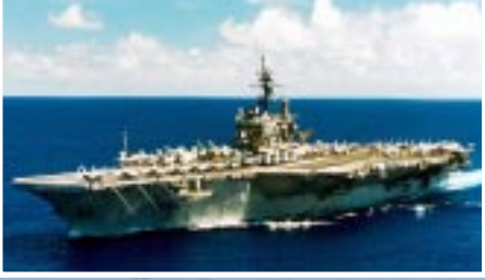
USS Constellation patrols the Pacific.