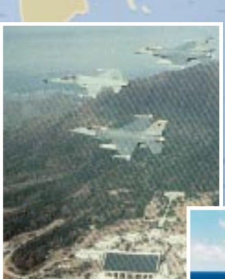
South Korea U.S. Air Force F–16Cs flank a Republic of Korea F–5 overflying South Korea's Independence Hall.