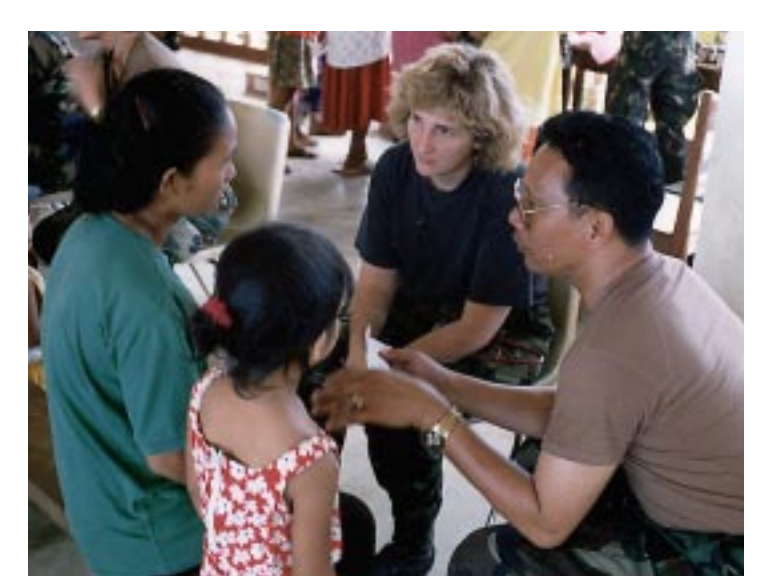
An Air Force doctor attends to a Filipino girl and her mother during a medical exercise in the Philippines.

serious commitment to the security and wellbeing of our treaty ally, and demonstrate how serious we are about remaining engaged in the Asia-Pacific region.