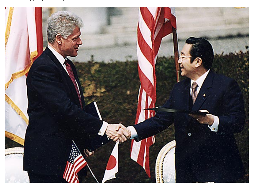
"In only these five decades, we [the United States and Japan] have reaped enormous benefits, building the two largest economies in the world and creating a tremendous force for security and stability during an era of constant change and frequent upheaval. . . . We have achieved much. For the new century that lies before us, if we maintain our resolve, we can accomplish much more."

President Clinton and Japanese Prime Minister Ryutaro Hashimoto at the release of the Joint Declaration on Security, April 17, 1996.