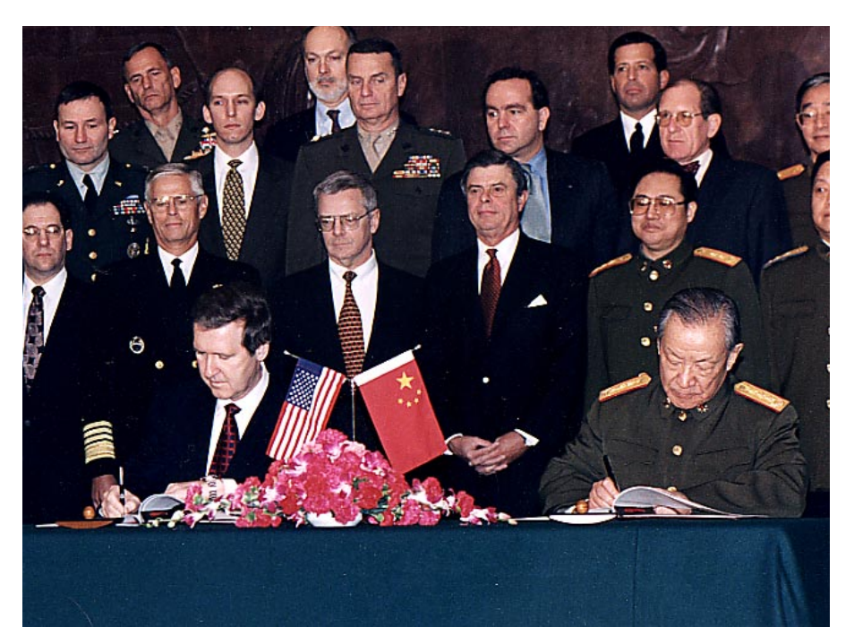
Secretary of Defense William Cohen and Minister of Defense Chi Haotian of China sign the Military Maritime Consultative Agreement in Beijing, January 19, 1998.

economic development. We share with China an interest in its emergence as a stable, prosperous nation. We both share strong interests in maintaining peace on the Korean Peninsula and in preventing the spread of weapons of mass destruction and their means of delivery. We both have concerns for world and Asian stability resulting from nuclear testing in India and Pakistan. We cooperate in countering a wide range of non-conventional security threats.