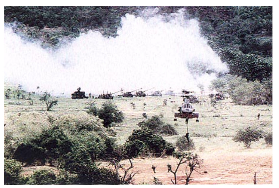
United States and Royal Thai Marines fast rope from a CH–46 Sea Knight helicopter during Exercise COBRA GOLD '95.

The U.S. also envisions continued expansion and deepening of the U.S.-Australia alliance over the coming years. Australia will continue to be important to our presence in Southeast Asia, as the U.S. and Australia develop and monitor interaction and cooperation on security issues through our well-established working relationships and the AUSMIN ministerial meetings. With continued development and planning, Australia will provide an increasingly